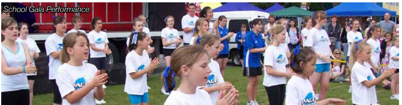
School Gala Performance

Pacific Cheerleaders will attend several events during the year. Competitions are listed under the heading "Important Dates" above. Competition dates are tentative and will be confirmed closer to the event. Other special events will occur during the year, and these dates will be announced as they come up. Each athlete will be required to purchase a Pacific Cheerleaders t-shirt to be worn at all of these performance events.