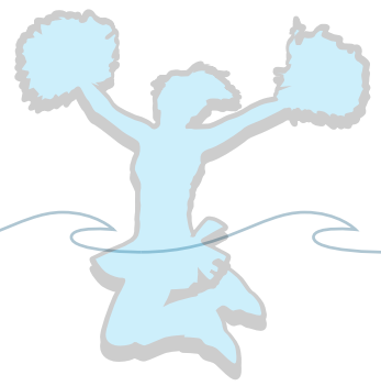
Orewa Santa Parade